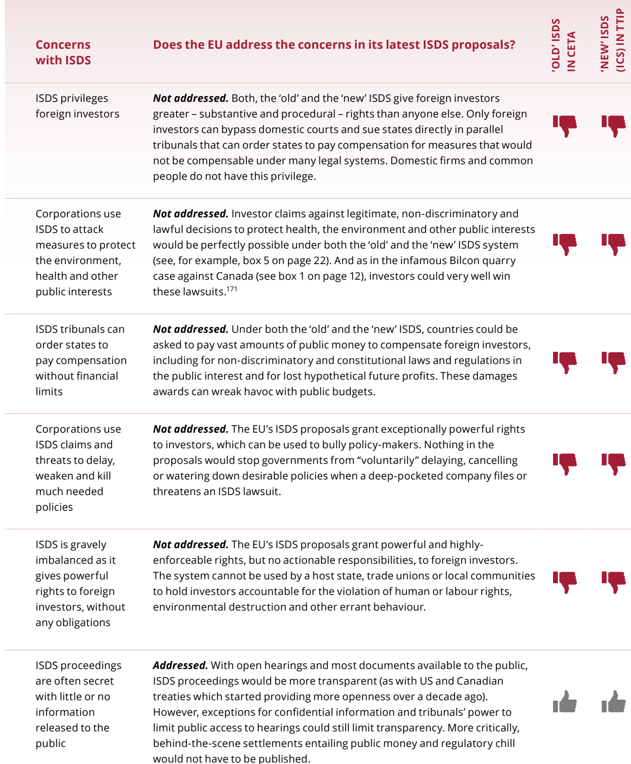
TABLE 1: More of the same corporate privileges